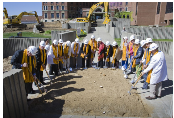
Ground Breaking April 27, 2010