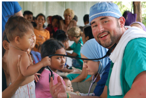
University of Michigan-Flint, Nursing students, on a recent mission trip to Cambodia. (My how field trips have changed!)