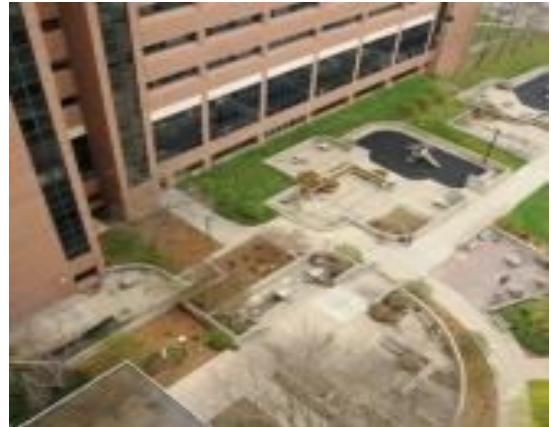
Pre construction site

"This ED expansion will enable Hurley to continue providing the highest quality of patient and family centered care available, enhancing its status as a community teaching hospital and research center of excellence," adds Wardell.