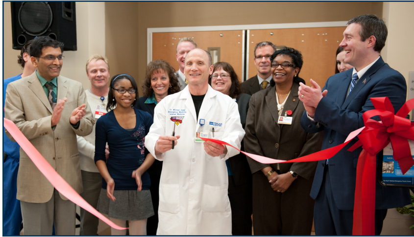
Ribbon Cutting Ceremony