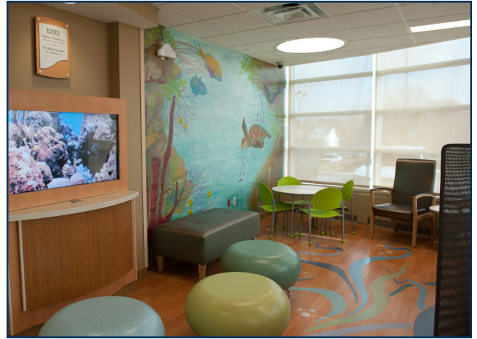
Pediatric Emergency Department Waiting Room

On February 24, 2012, the Ribbon Cutting celebration and press conference for the Paul F. Reinhart Emergency Trauma Center was held in the Main Lobby. Hurley Medical Center hosted staff, Hurley Board of Managers, elected officials, community leaders and the media for the Ribbon Cutting Celebration of the Paul F. Reinhart Emergency Trauma Center - our new state of the art ED expansion project.