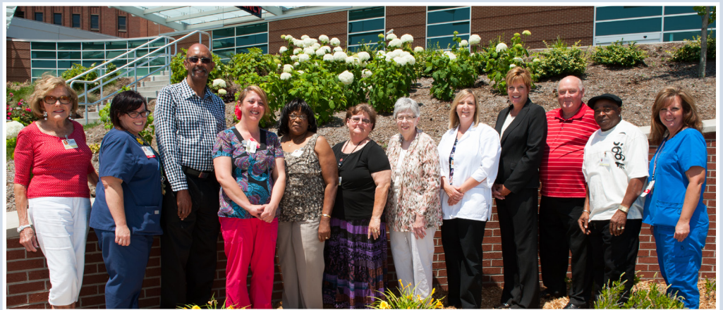
The Center for Joint Replacement - Patient and Family Council Members

In the initial meetings, council advisors brainstormed to create the perfect joint replacement experience. They worked closely with us to enumerate our areas of strength and areas of needed improvement. The first project the group chose to work on was improving our patient education materials. For the past several months, the advisors have been authoring, revising and editing our Joint Replacement Patient Manual, which will be ready for new