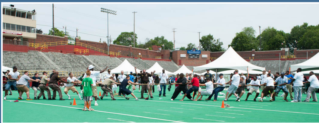
Men's Fest attendees participate in a friendly match of tug-of-war

On June 16, over 1,000 men from around Mid-Michigan attended Hurley's 1st Men's Fest - a FREE comprehensive Men's health and wellness event at Atwood Stadium in Flint, featuring fun, fitness, fellowship and so much more. The keynote address was provided by Mark Ingram, Flint native and Heisman Trophy Winner. Hurley's Men's Fest included a variety of activities geared towards educating and improving the health of men and their families throughout Mid-Michigan and beyond.