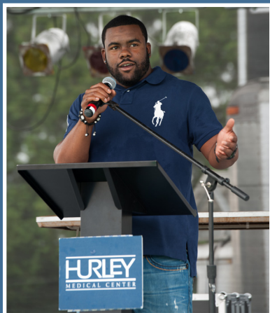
Mark Ingram, Heisman Trophy Winner addresses the crowd

Published for the Physicians of Hurley Medical Center.