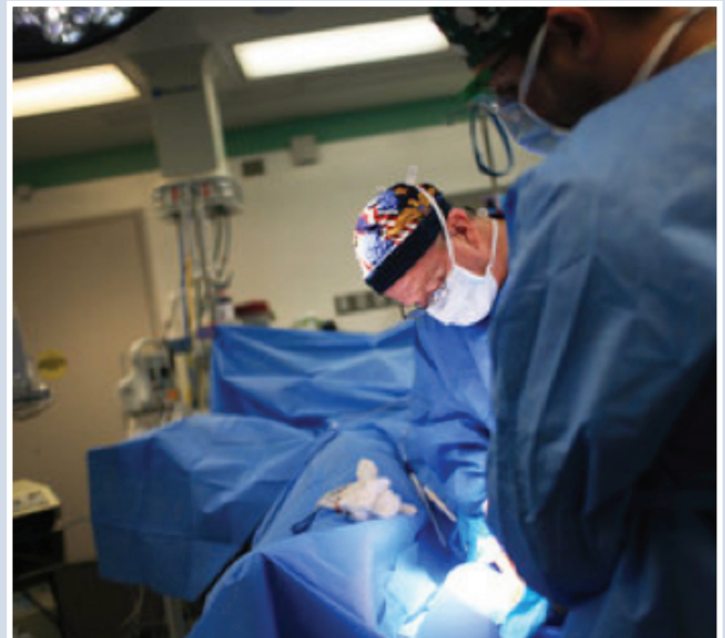
Portions of this article were printed in the Flint Journal on January 3, 2012.

"Over here for the most part, no one's shooting at you. Over there they're still shooting at you," he said. "I'm very lucky that I don't have to go outside the wire. ... I joke with my wife when she's worried saying 'We do get attacked on occasion, but don't worry — they're pretty bad shots.'"