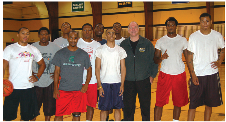
Mott Community College Basketball Team

For athletes needing physical therapy before returning to play,